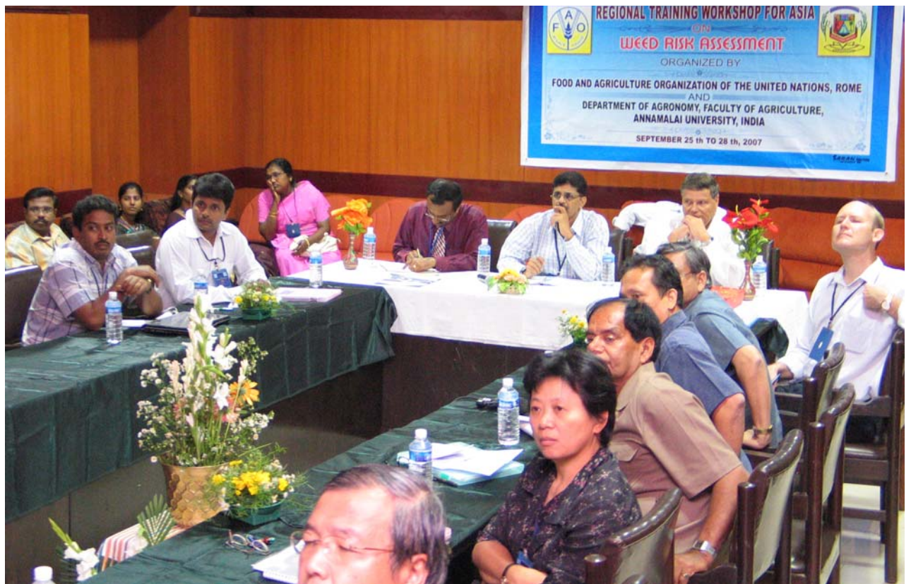
Photograph shows a Workshop Session in progress