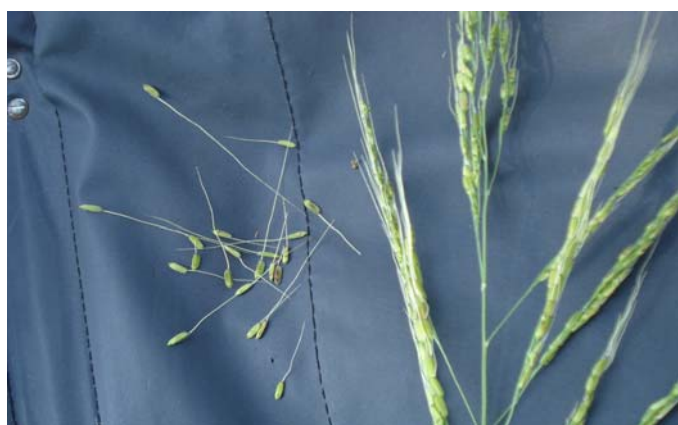
Photographs of inflorescence and seeds Oryza rufipogon found at BCKV.