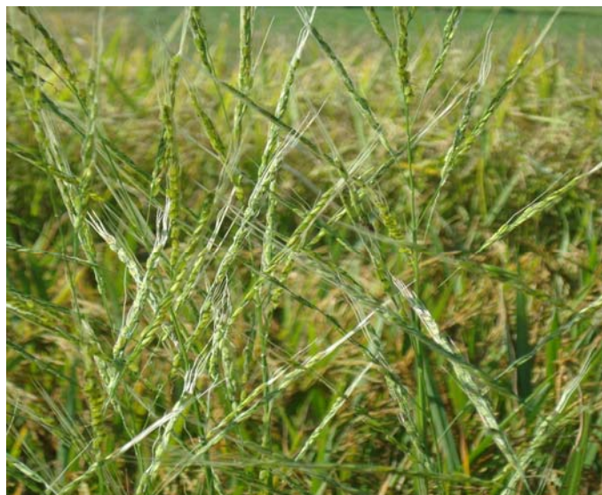
Photographs of Oryza rufipogon found at BCKV.

More information can be obtained from R.K. Ghosh ( rkgbckv@rediffmail.com ).