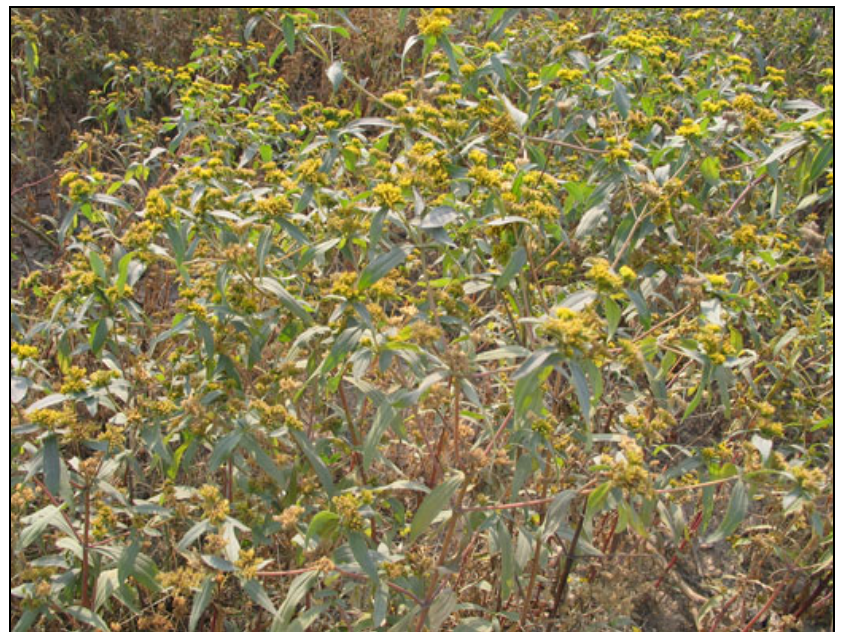
A photo of Flaveria bidentis .

There are no effective measures available yet for farmers to take to control of the infestations, and the species could become troublesome for the development of sustainable agriculture. Research done during last two years shows that the alien weed germinates in late spring and grows throughout summer and reproduces very fast.