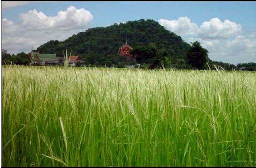
A serious infestation of weedy rice (Khao Harn) in a rice field in Thailand

From light infestation of 5-10%, farmers who carry on with routine crop management, which includes application of selective rice herbicides, find their fields completely taken over by weedy rice within three to four crops. By the time infestation reaches 40%, yield is about halved, and with 80-90%, infestation the entire crop is lost.