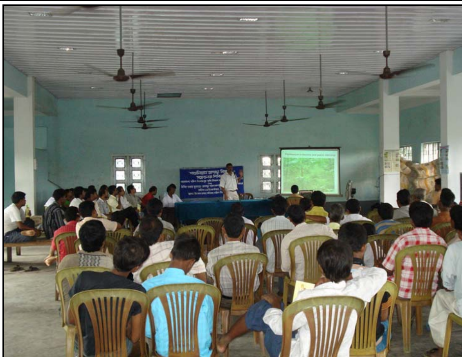
Photograph showing the National Parthenium Awareness campaign.

Prof Ghosh discussed the management of Invasive weed Parthenium along with its menace and beneficial effects through different slides.