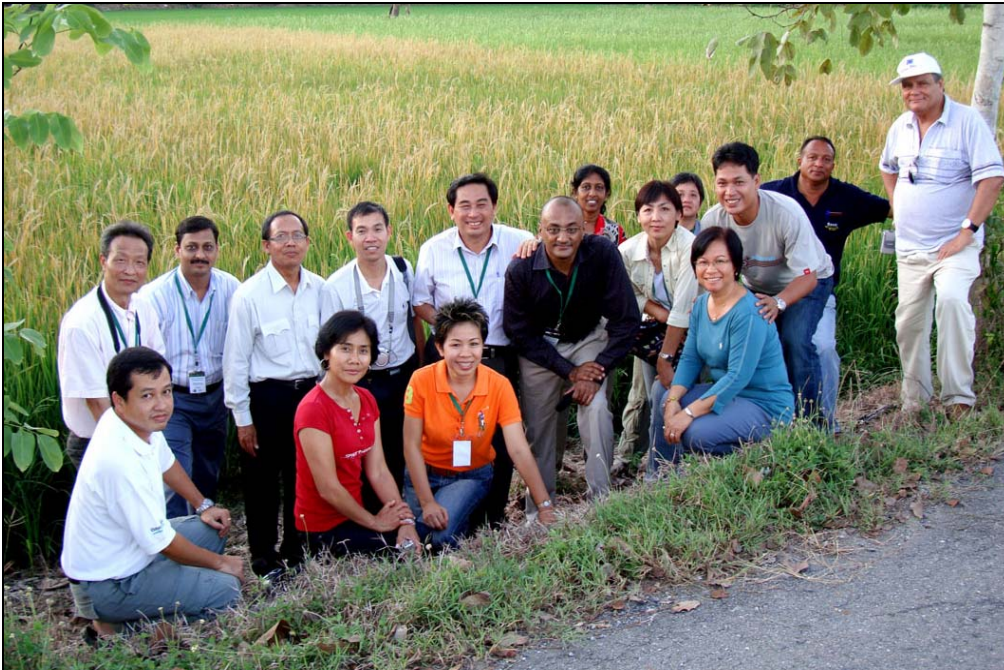
Photograph shows some of the attendees during a field visit.