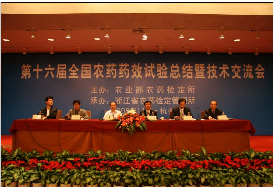
Photograph showing the inaugural session of the 16 th Conference

In China, according to its Pesticide Act, the registration of new pesticides requires mandatory field trials to evaluate the bioactivity of herbicides and pesticides against weeds and pests and for safety to crops. Once every two-years, a national conference is organized by ICAMA to review the field trial results of new pesticides that are under evaluation in field trials.